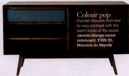
Colour pop Painted drawers from teal to navy contrast with the warm tones of the wood. Janeiro mango wood sideboard, £399.50, Maisons du Monde