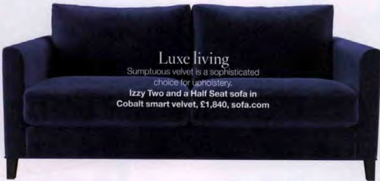
Luxe living Sumptuous velvet is a sophisticated choice for upholstery. Izzy Two and a Half Seat sofa in Cobalt smart velvet, £1,840, sofa.com