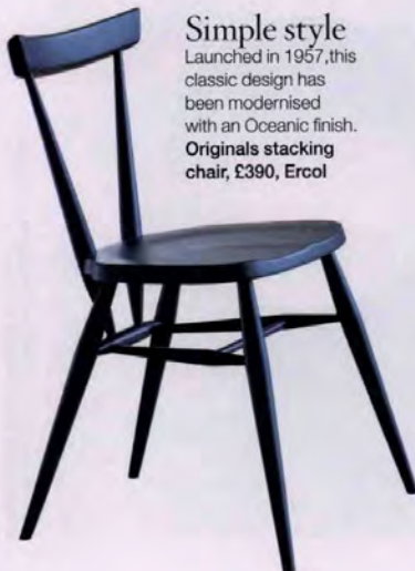
Simple style Launched in 1957, this classic design has been modernised with an Oceanic finish. Originals stacking chair, £390, Ercol