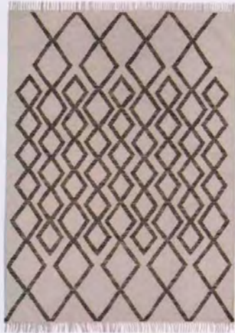
Print works Add interest with soft geometric patterns. Dalston rug, from £245, Floor Story