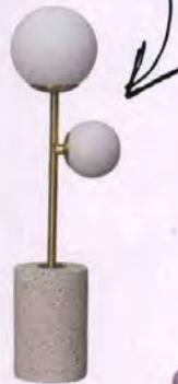
Sculptural glow Two spherical shades on a concrete base will illuminate a gloomy corner. Floreli lamp, £65, The British Home Store