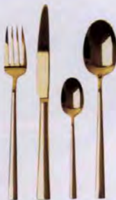
Subtle sparkle Glints of gold instantly add glamour to any dining scheme. Everett 16-piece cutlery set, £139, Swoon Editions