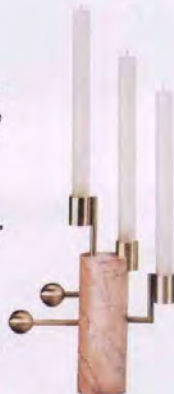
Solid investment This standout piece is sure to introduce instant style credentials to any room. Stargazer candleholder multi, £387, Lara Bohinc