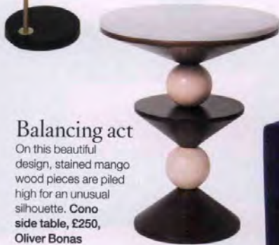
Balancing act On this beautiful design, stained mango wood pieces are piled high for an unusual silhouette. Cono side table, £250, Oliver Bonas