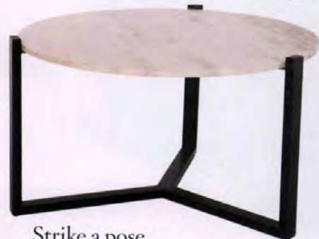
Strike a pose A black base on this elegant design brings some monochrome magic to a room. White marble table, £239, Atkin & Thyme FOR STORE DETAILS SEE WHERE TO BUY PAGE