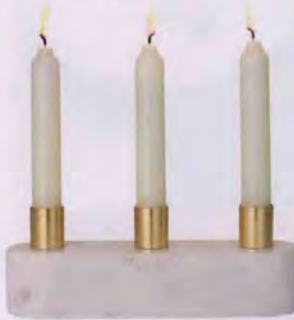
Light touch This modern update is the epitome of sophistication. Elisa candelabra, £20, Made