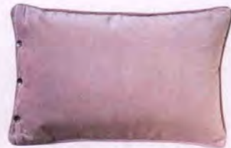
Tactile addition Made and dyed by hand, this will add texture and colour to a sofa. Velvet cushion in Light Mauve, £40, Home Address