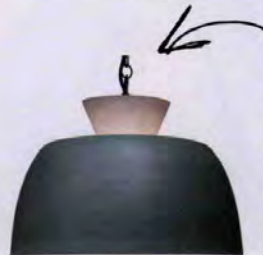
Metallic wonder The interior of this lovely retro model is white to maximise reflection of light. The Zermatt hanging lamp, £165, Pib