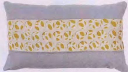
Sitting comfortably Printed linen has been laid under a strip of cut-out felt to create a fabulous effect. Skeleton and Dotty print cushion, £52, Georgia Bosson