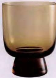
Honey tones Punctuate rose-pink and teal hues with drops of golden honey. Amber wine glass, £6, WA Green