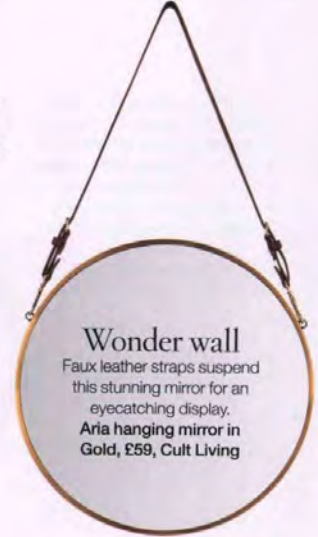
Wonder wall Faux leather straps suspend this stunning mirror for an eye-catching display. Aria hanging mirror in Gold, £59, Cult Living