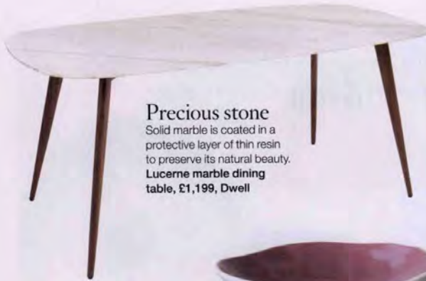
Precious stone Solid marble is coated in a protective layer of thin resin to preserve its natural beauty. Lucerne marble dining table, £1,199, Dwell